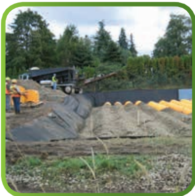
Angular stone backfill is placed around chambers