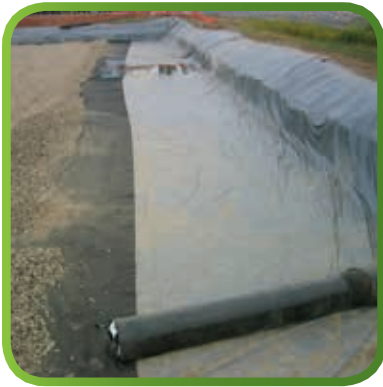
Non-woven fabric is placed over PVC liner before placing angular bedding stone.